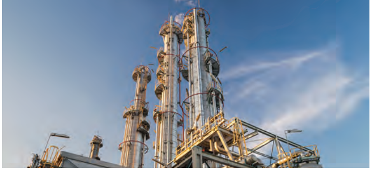
A large Texas refinery was experiencing major issues with a high temperature gas oil backwash feed filter system in the Hydrocracking unit. Jonell Systems recommended a high temperature cartridge based pre-filtration systems saving approximately $2 million per year in filter maintenance expense.